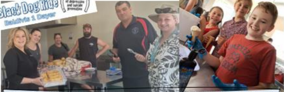
Black Dog Ride Lunch - We raised $1176 - Which was raised and went directly towards the Year 6 Camp.