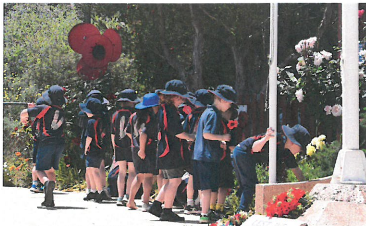
Above: The K/PP students placed individual poppies in the RSL garden.

The R.S.L provided a beautifully prepared individual fruit cup for each child. We thank the R.S.L. for providing our students with this valuable opportunity to commemorate this very important event.