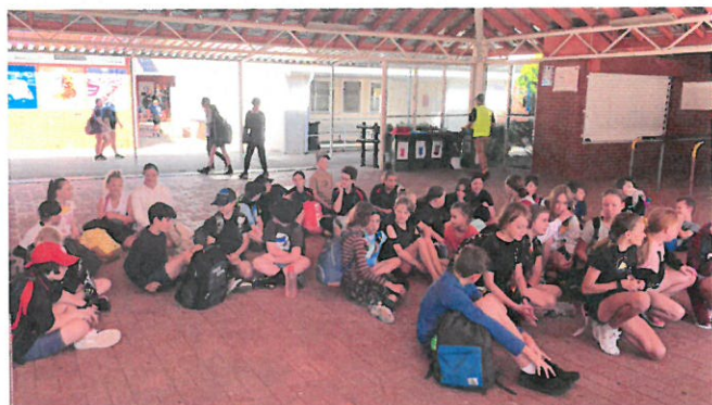
Below: Dwellingup PS year 6 students at Pinjarra SHS with students from Carcoola and North Dandalup.