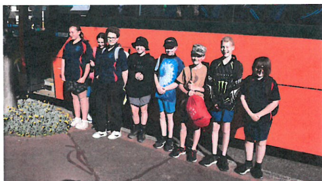
Above: Part of the Transition experience is to travel to Pinjarra SHS on the high school bus.

Last Wednesday our year 6 students who are attending Pinjarra SHS participated in a Transition Small Schools Activity day with year 6 students from Carcoola and North Dandalup Primary Schools. Students were provided with a range of fun activities including kayaking. The aim of this day is to provide an opportunity for students from the smaller schools that feed into Pinjarra SHS to get to know each other before the Transition Days in Week 8. There are nearly 100 students entering Pinjarra SHS from Pinjarra Primary School so it's great that our students can make some new friends.